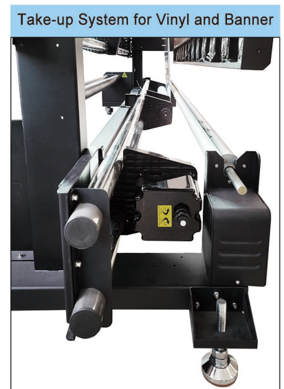
Take-up System for Vinyl and Banner