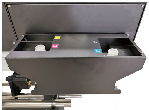
Cartridge - Neat and Tidy