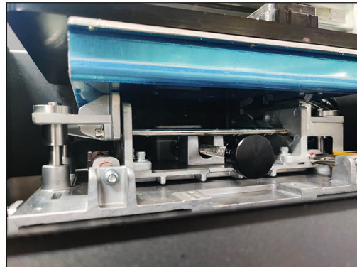
Robustic Cap Station