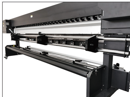
Feeding System for Vinyl and Banner